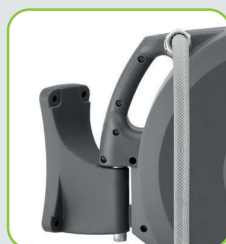
plug on function for intake hose