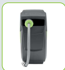
safe and controlled hose-intake