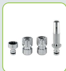
incl. push-fit system made of brass