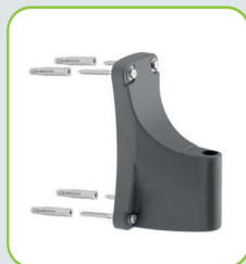
incl. mounting kit and wall mount