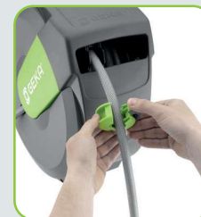
adjustable without tools