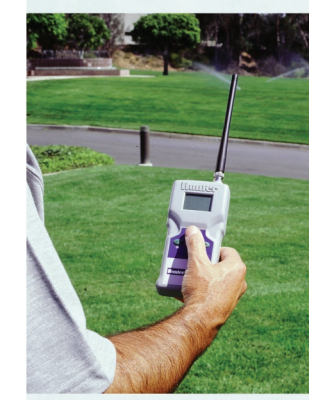
The ICR Remote Control provides the installer maximum range capability (up to 2 miles) for large commercial sites.

400 = 4-Station Plug-in Module for use with any ICC Controller Model 800 = 8-Station Plug-in Module for use with any ICC Controller Model