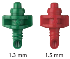
1.3 mm 1.5 mm