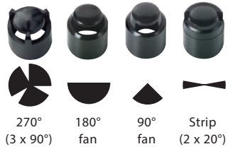
270° (3 x 90°) fan 180° fan 90° fan Strip (2 x 20°)