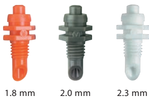
1.8 mm 2.0 mm 2.3 mm