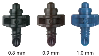
0.8 mm 0.9 mm 1.0 mm