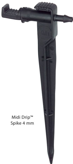
Midi Drip™ Spike 4 mm