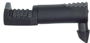
Midi Drip™ Barb 4 mm