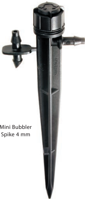
Mini Bubbler Spike 4 mm