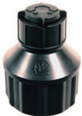
Mini Bubbler Thread 1/2"