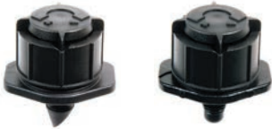
Mini Bubbler Barb 4 mm